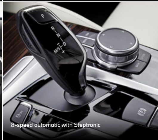
8-speed automatic with Steptronic