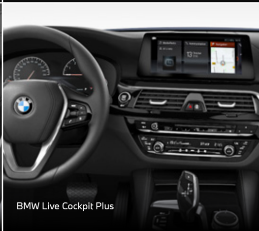
BMW Live Cockpit Plus