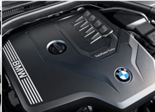
BMW TwinPower Turbo, in-line 4-cylinder Petrol