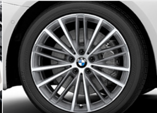
19" light alloy wheels V-spoke style 635 with mixed tyres and run-flat tyres